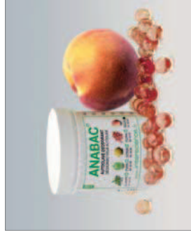
Peach Sweet fragrance