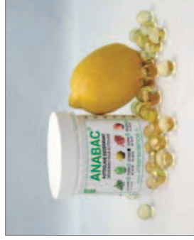
Citrus Tonic fragrance