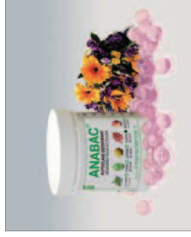
Floral Spring fragrance