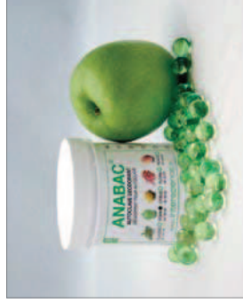
Poma Fresh fragrance