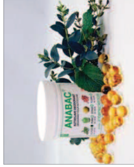
Classic Strong fragrance

Anabac® provides a nice and fresh perfume in the lab after autoclaving. Choose between 5 fragrances!